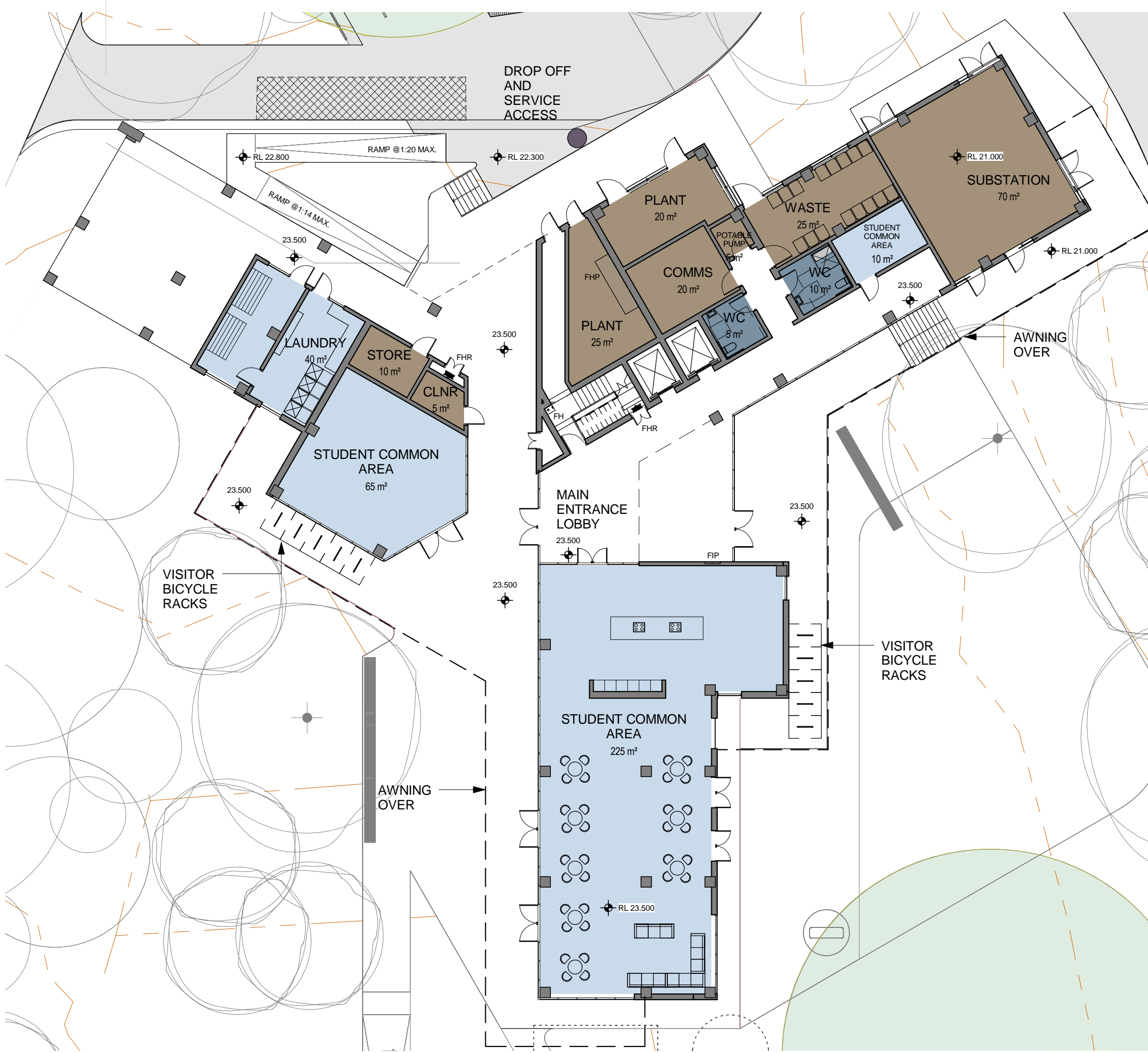
2 B - Ground Floor Scale: 1 : 200