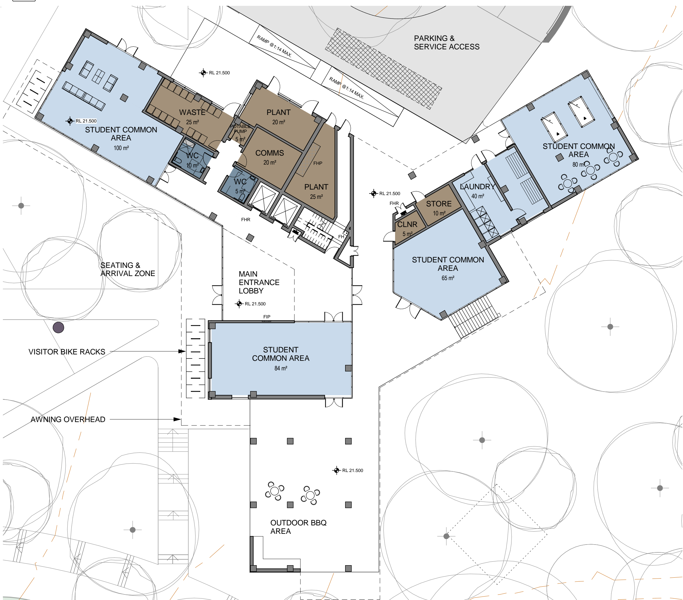
3 C - Ground Floor Scale: 1 : 200