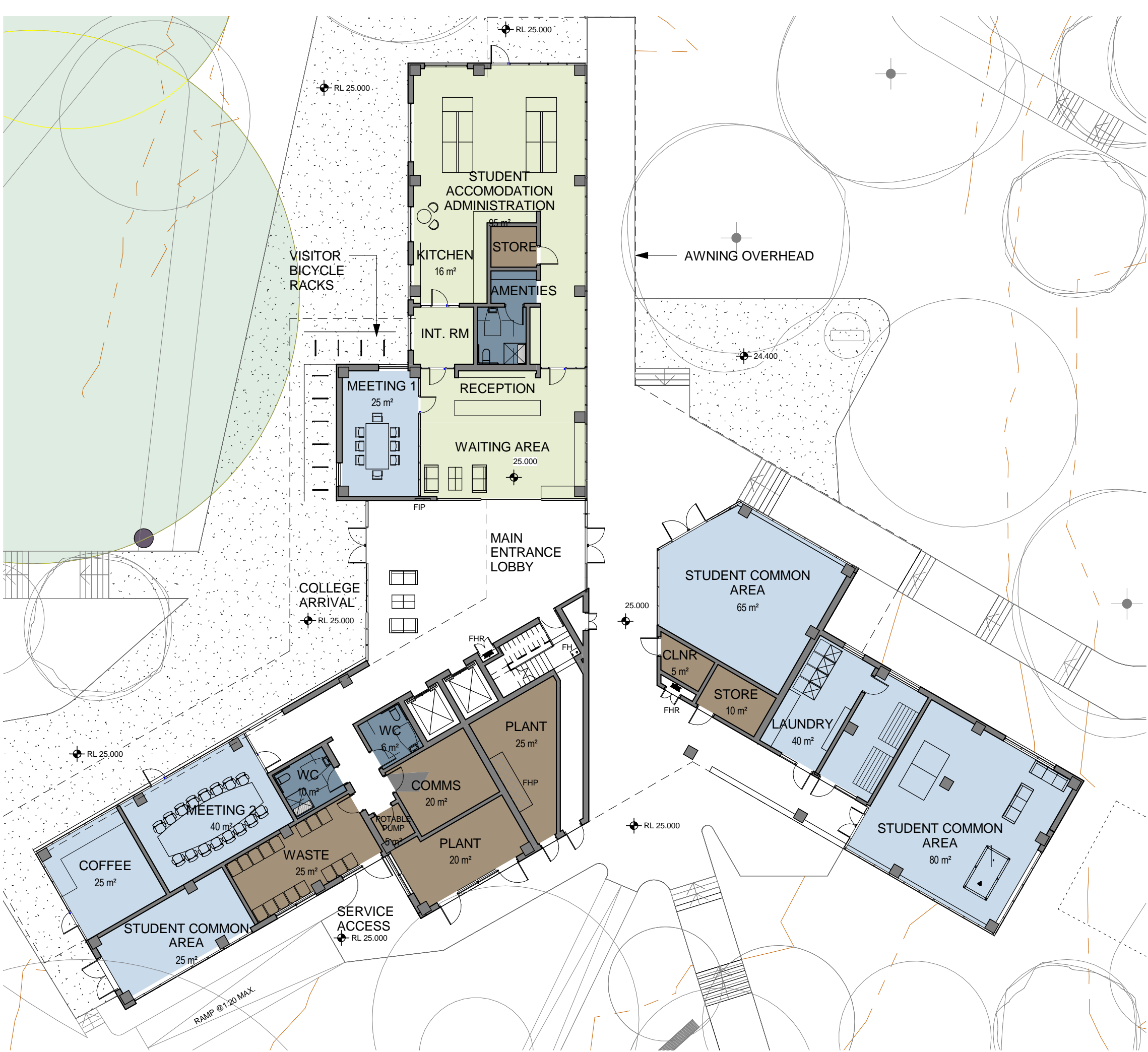
1 A - Ground Floor Scale: 1 : 200